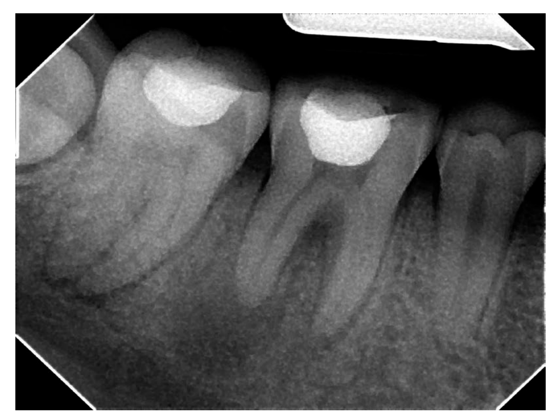
Figure 3: #30 preoperative X ray showing periapical radiographic lesion