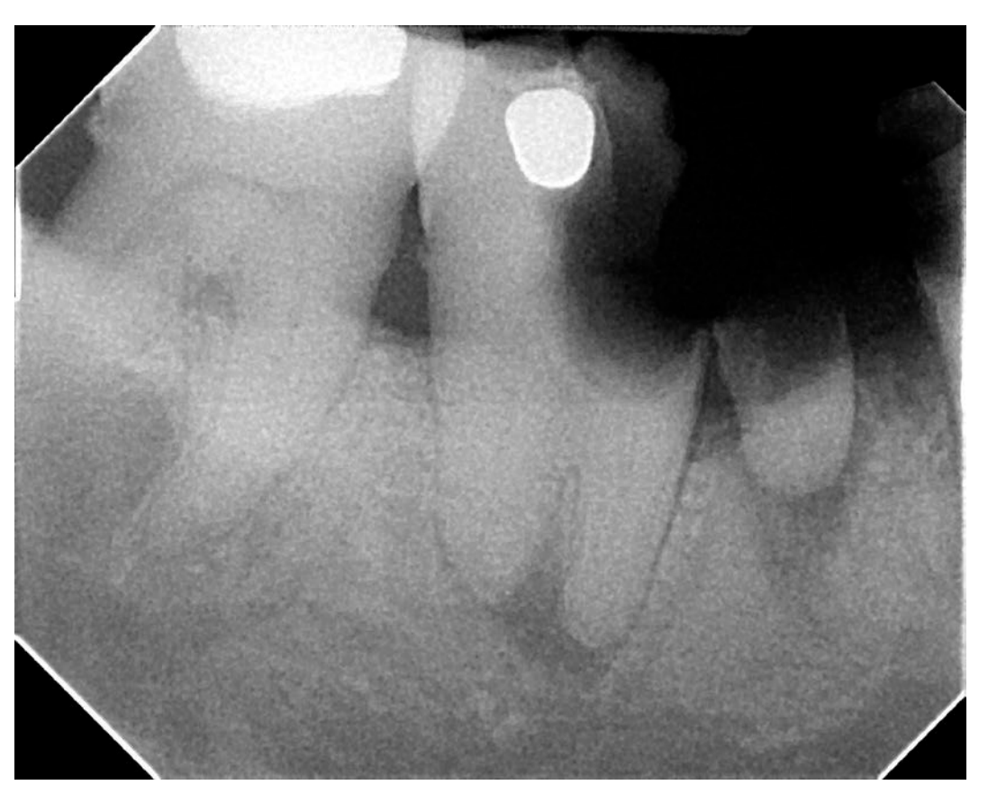
Figure 1: preoperative #31 X ray showing periapial radiographic lesion