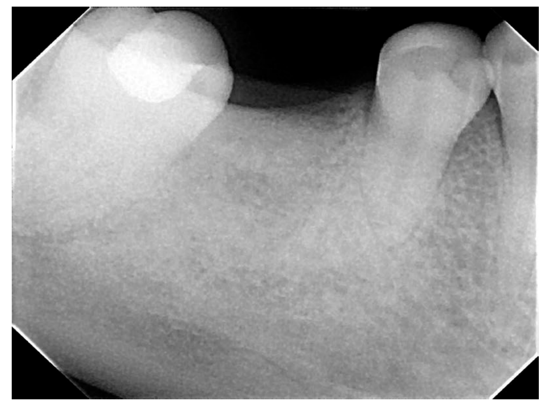
Figure 4: #30 48-month postoperative X ray showing complete radiographic healing